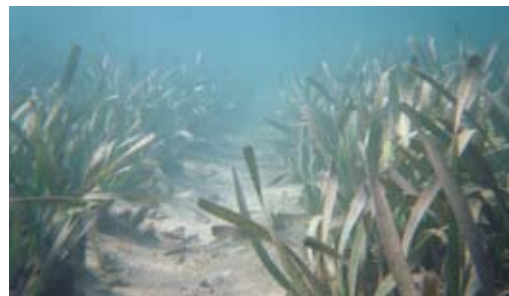
Propeller damaged seagrass